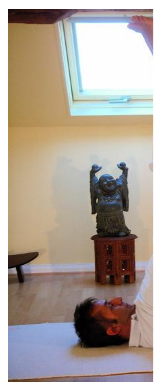
arvangasana - The Shouder Stand

Sarvangasana is a type of inverted asana from hatha yoga. It is widely considered to be one most important asana.