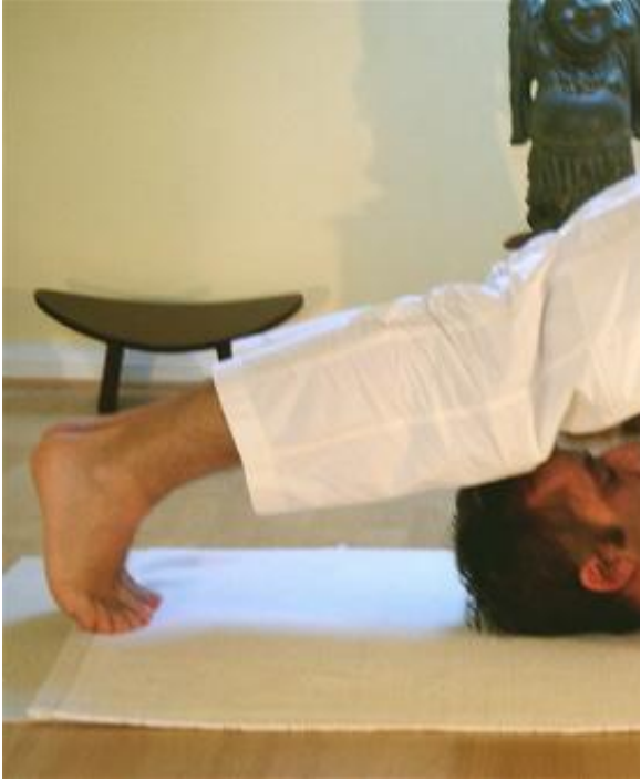
Halasana – The Plow