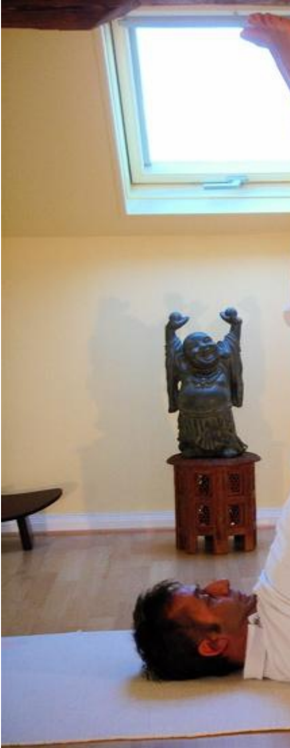
arvangasana – The Shouder Stand

Sarvangasana is a type of inverted asana from hatha yoga. It is widely considered to be one most important asana.