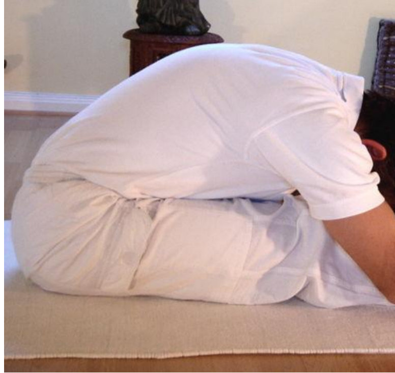
Paschimottasana – The Intense Stretch of the West

Pssst.... do you want to learn the really advanced content that we couldn't include in this eBook?