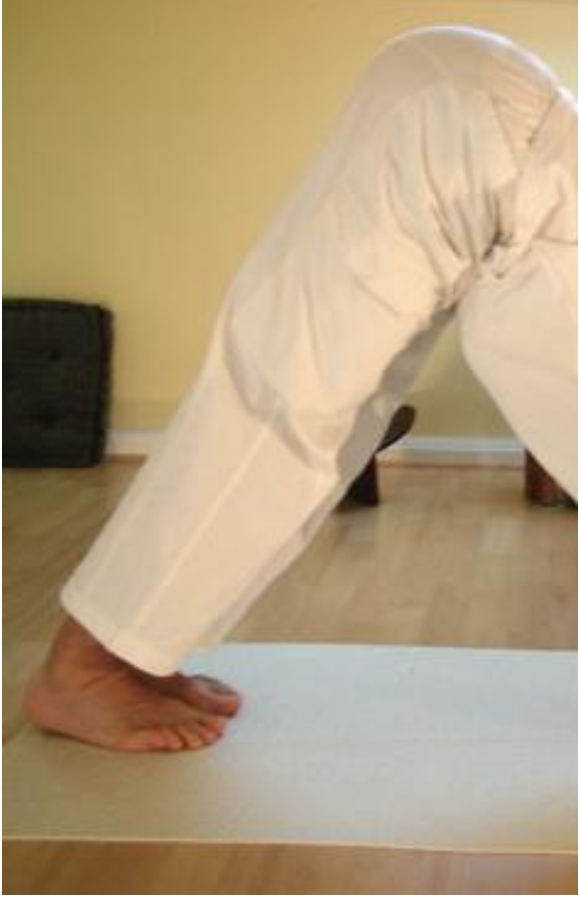
Adho Mukha Svanasana – The Downward Facing Dog

Pssst.... do you want to learn the really advanced content that we couldn't include in this eBook?