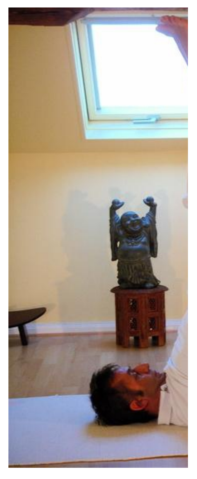
arvangasana – The Shouder Stand

Sarvangasana is a type of inverted asana from hatha yoga. It is widely considered to be one most important asana.