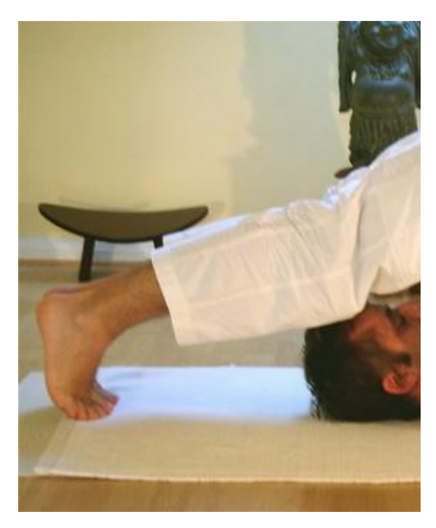
Halasana – The Plow