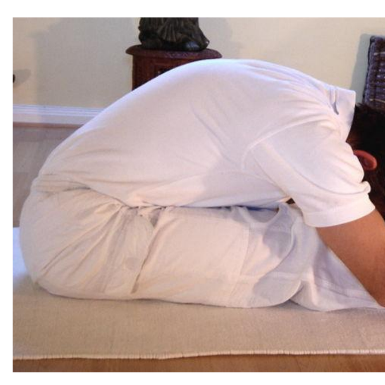
Paschimottanasana – The Intense Stretch of the West